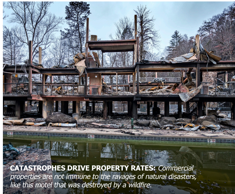
CATASTROPHES DRIVE PROPERTY RATES: Commercial properties are not immune to the ravages of natural disasters, like this motel that was destroyed by a wildfire.

Construction costs have skyrocketed in the wake of unprecedented building material cost increases, a labor shortage in the construction