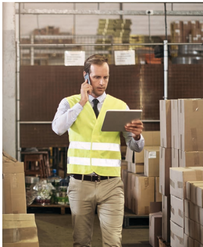
DEADLY DISTRACTION: Using mobile devices in a busy work environment can lead to serious injuries, or worse.