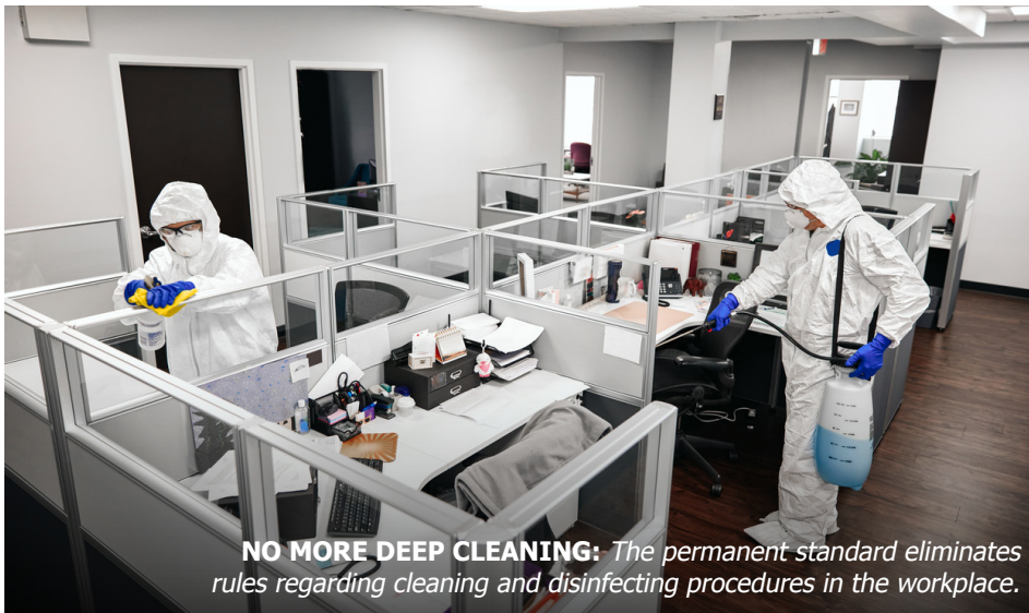
NO MORE DEEP CLEANING: The permanent standard eliminates rules regarding cleaning and disinfecting procedures in the workplace.

C AL/OSHA has taken the first step towards creating a semi-permanent COVID-19 standard to replace the emergency temporary standard that currently governs workplace coronavirus prevention measures in the state.