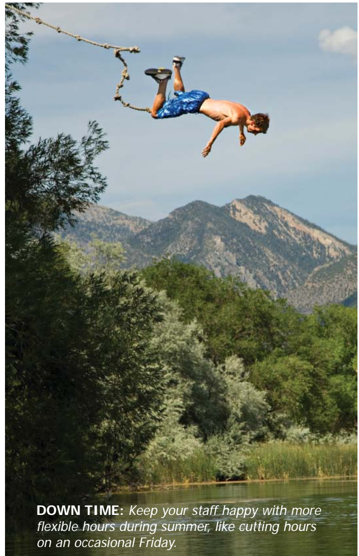
DOWN TIME: Keep your staff happy with more flexible hours during summer, like cutting hours on an occasional Friday.