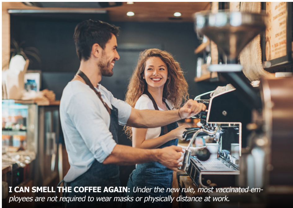
I CAN SMELL THE COFFEE AGAIN: Under the new rule, most vaccinated employees are not required to wear masks or physically distance at work.