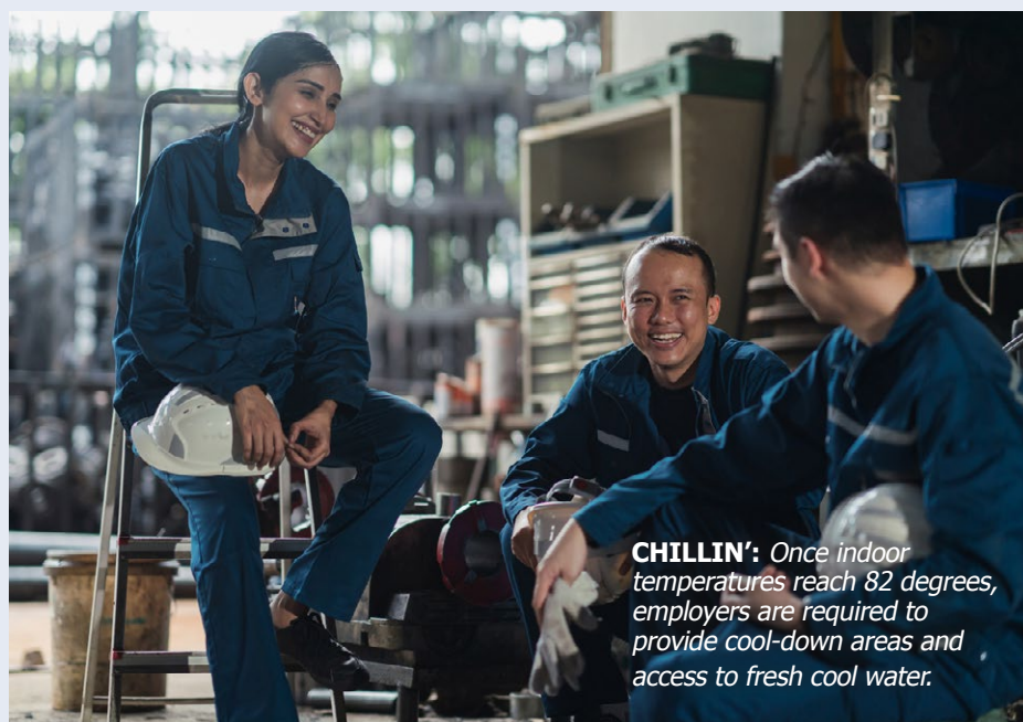
CHILLIN': Once indoor temperatures reach 82 degrees, employers are required to provide cool-down areas and access to fresh cool water.

Employers whose indoor workplaces may exceed the 82-degree threshold will need to create, maintain and make available to employees a heat illness prevention plan (HIPP), which all affected employees should be trained in and read. The plan covers all of the following.